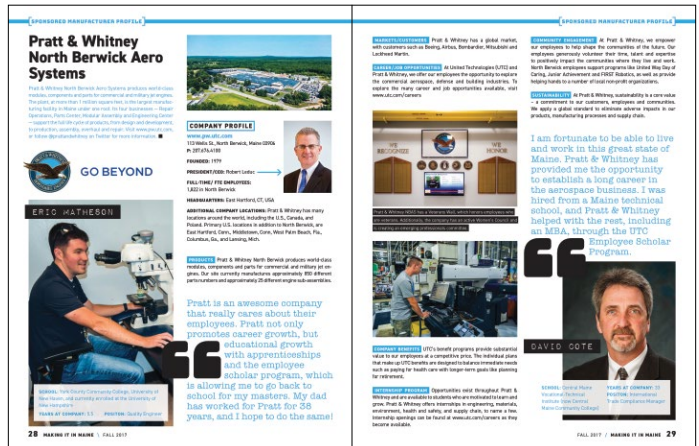
SAMPLE TWO PAGE PROFILE